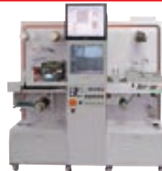
ArrowCut Nova 250R