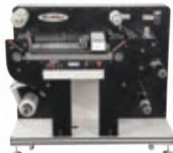
Arrow EZCut 330R