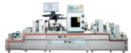
ArrowCut Nova 330R